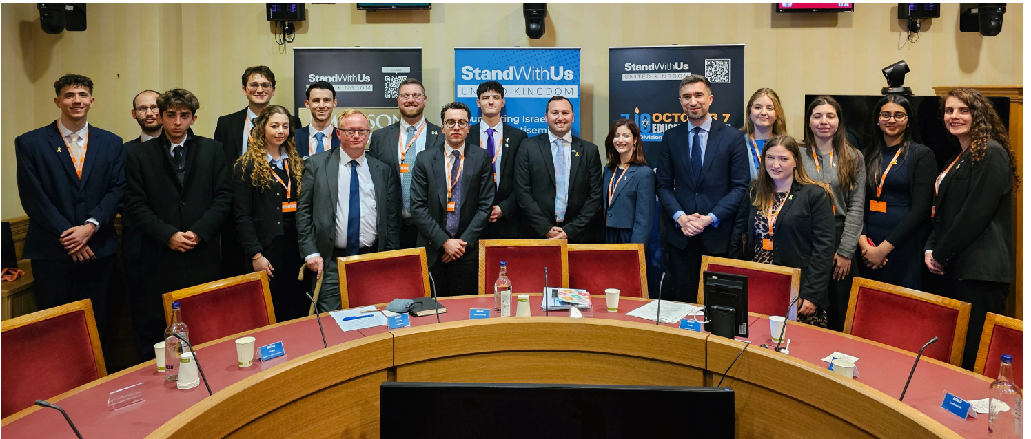
Student Testimony at the House of Lords on the state of anti-Israel hatred on campus, March 11th