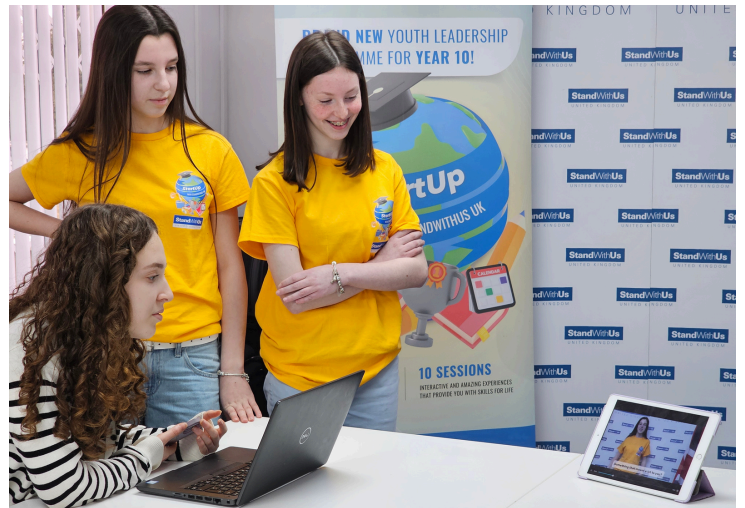
StartUp students creating their projects