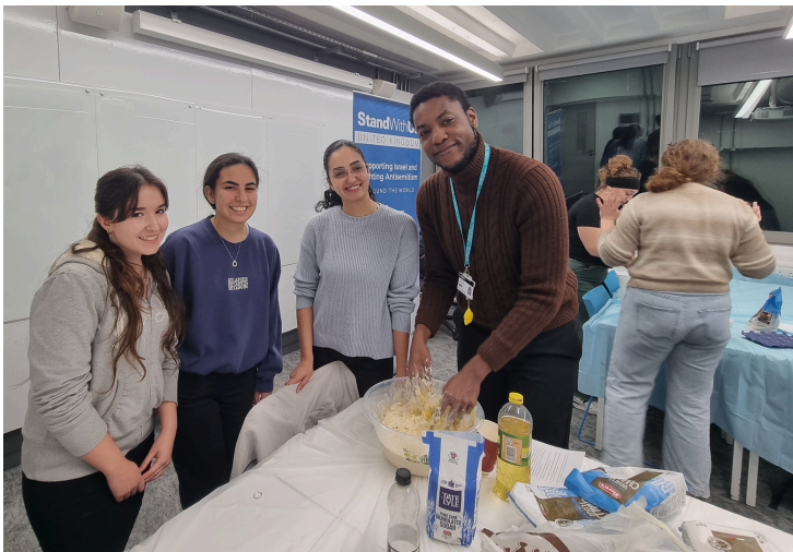
Challah Bake at Westminster University, February 6th