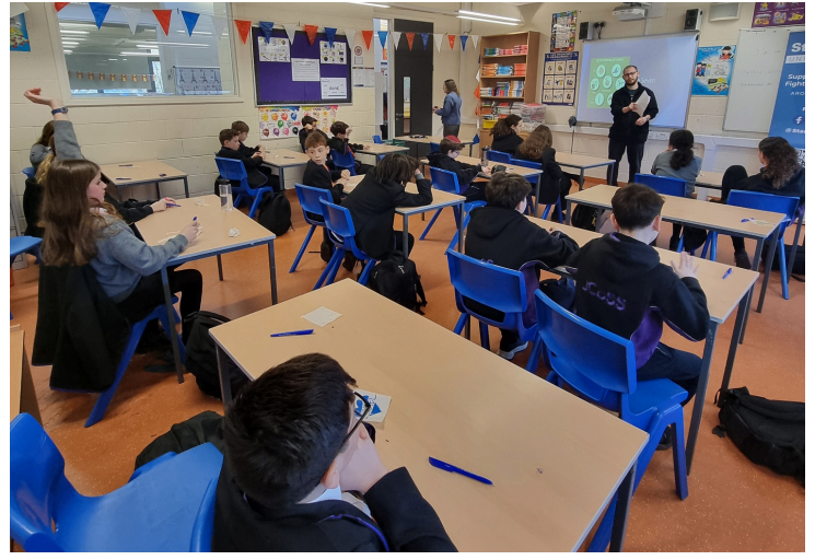
StandWithUs UK Activity at JCoSS, January 30th