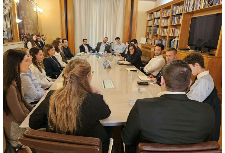
Student Testimony at the Israeli Embassy, March 19th