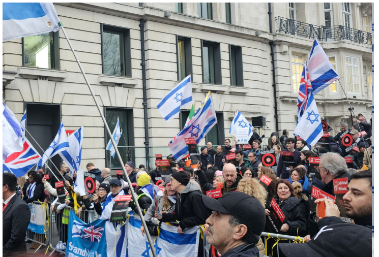
Protest at LSE Against Hamas Book Launch, March 10th