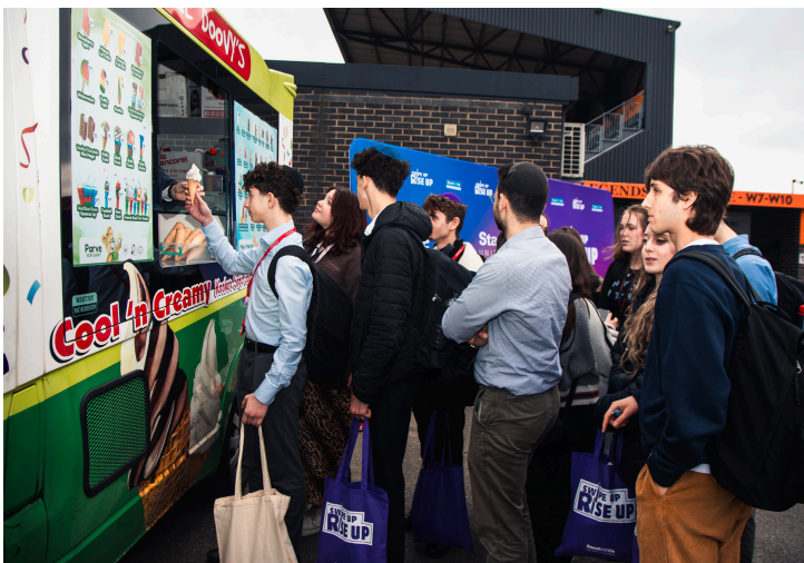
A treat at the end of Swipe Up Rise Up, March 27th