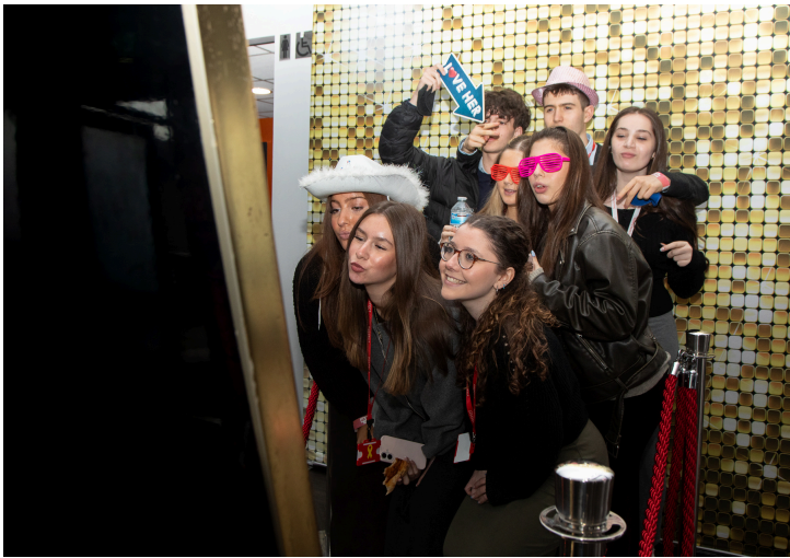
Swipe Up Rise Up Expo, March 27th