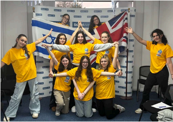
StartUp Class of 2025