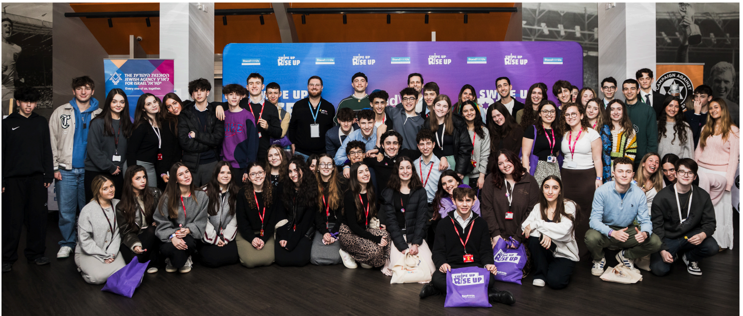
Swipe Up Rise Up, March 27th