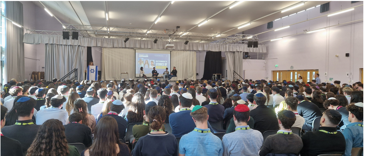
StandWithUs UK "Stories of Resilience" Tour at JFS, October 7th