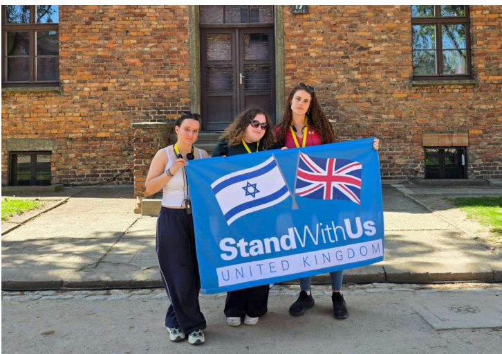
StandWithUs UK Delegation to March of the Living, April 23rd