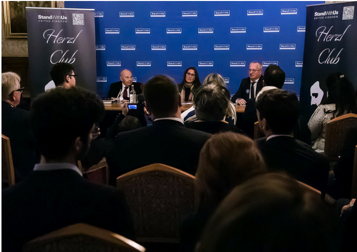
23rd November, UK-Israel Relations Booklet launch at House of Lords