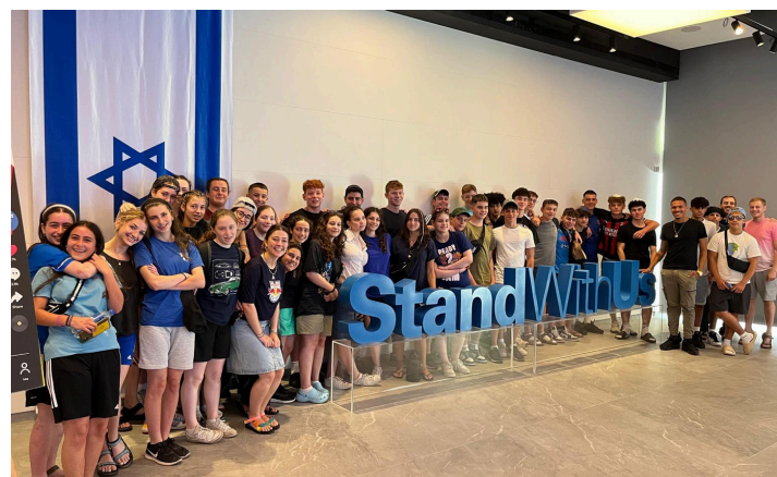
5th July, Bnei Akiva UK group visit the StandWithUs office in Jerusalem