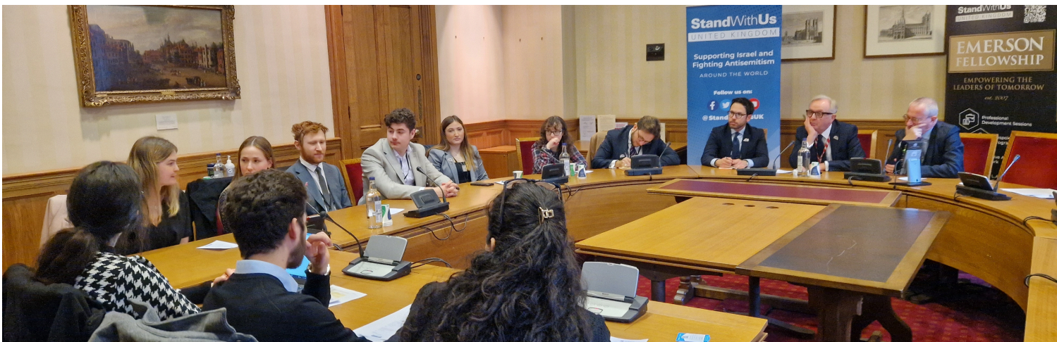
1st February, StandWithUs hosts a roundtable discussion regarding antisemitism at UK universities between students and members of the House of Lords