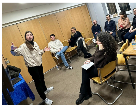
24th January, Explore session at JLE