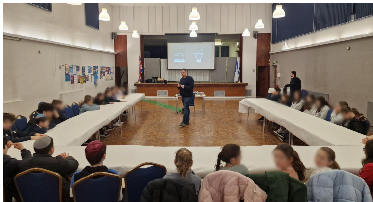
7th February, Bnei Mitzva Workshop at Woodside Park

In the hours after the atrocities of October 7th, we worked on developing a presentation to be delivered to school pupils. The presentation, titled "Israel Under Attack", was delivered to thousands of pupils across many schools, synagogues and youth groups in the UK.