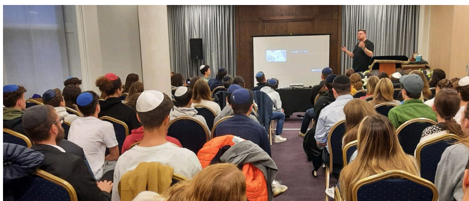
15th October, a talk to youth at Chabad Belgravia