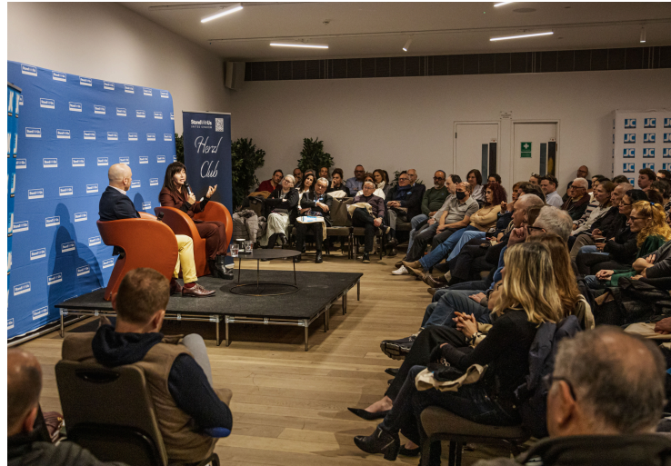
25th February, Einat Wilf addresses over 200 people at South Hampstead Shul