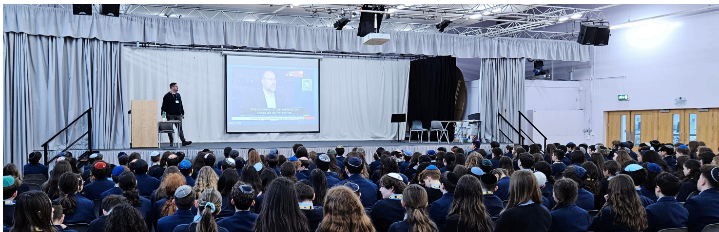
30th January, "Israel Under Attack" Session at JFS