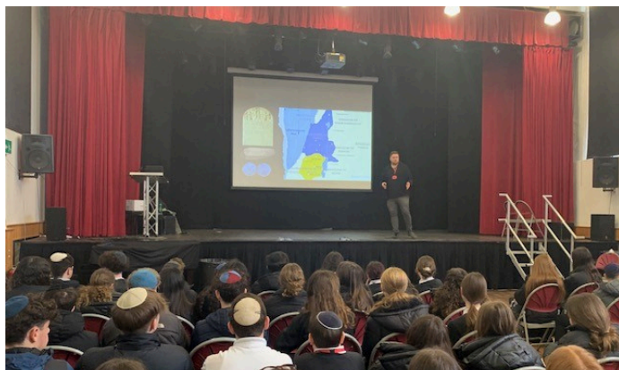
16th January, special session at Yavneh College with Year 10