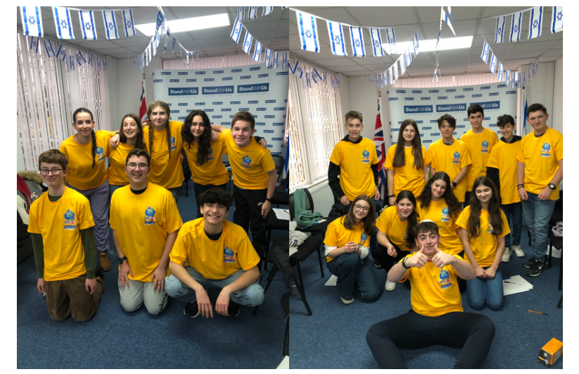
November, StartUp groups "Waze" and "Netafim" proudly show off their t-shirts!