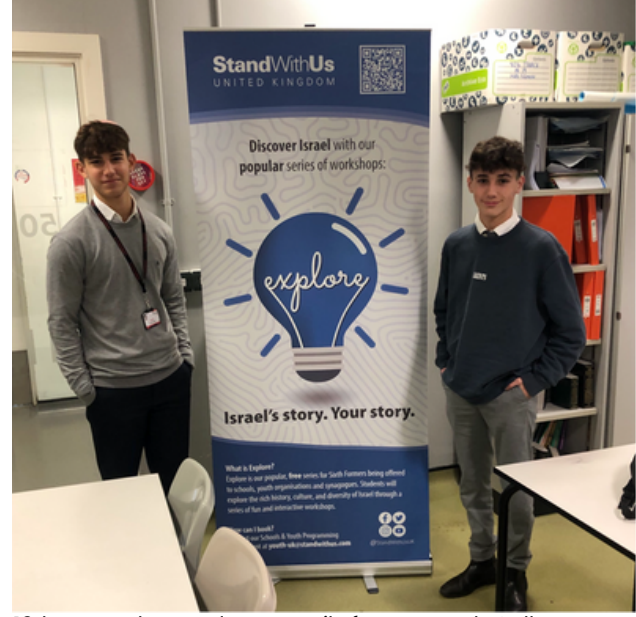
16th November, Explore+ pupils from Yavneh College following completion of the course

For more information about Explore visit our website.