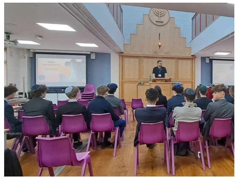
10th October, briefing about October 7th at Immanuel College