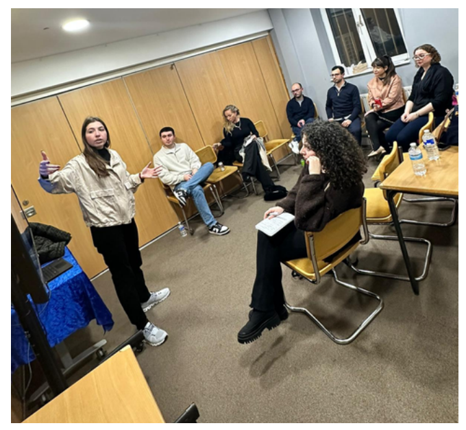
24th January, Explore session at JLE

We continue to work hard to reach and deliver content to as many people in-person, and online, with sessions or literature! Check out some of our highlights.