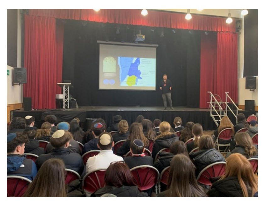
16th January, special session at Yavneh College with Year 10

Yavneh College pupils were all thoroughly engaged with excellent questions!