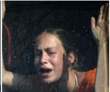
A child being evacuated from her home.

Israel hoped that the removal of any Jewish presence would reduce Palestinian grievances and help them begin nation-building. The Israeli government left the flourishing Jewish greenhouses intact for Palestinians to use to begin developing their own economy.