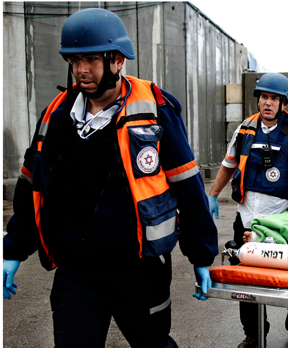
Two Palestinian youths were transferred from Gaza to Israel in addition to the two youth, approximately 20 chronically ill youths, to Israeli hospitals. January 2, 2009.

For seven years, Hamas and other terrorists from Gaza bombarded southern Israel with thousands of rockets and mortars, and Israel exercised restraint. Israel mounted a defensive operation only in December 2008, when Hamas refused to renew the six-month truce and launched barrages of rockets at the half million men, women, and children living in southern Israel.