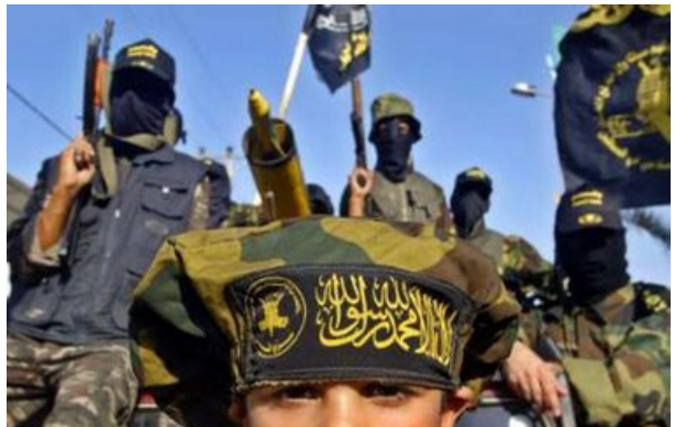
Hamas and other terrorist groups felt empowered, claiming their violence had driven the Israelis out of Gaza.

Palestinians were as enraged by Israel's departure from Gaza as by Israeli presence in Gaza.