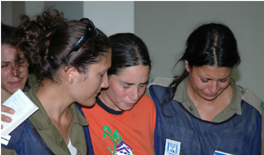
IDF soldiers comfort the anguished evacuees even as they enforce the disengagement.

2005: Israel withdrew from Gaza to promote peace. Israel evacuated all Jews from the thriving Gaza communities they had built over the previous 30 years. The policy was divisive and wrenching for Israelis, pitting soldier against civilian, family against family.