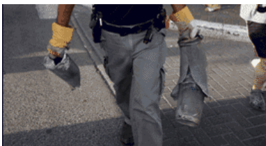
A GRAD struck an Ashkelon shopping mall on May 14, 2008, wounding 90 people, including young children.