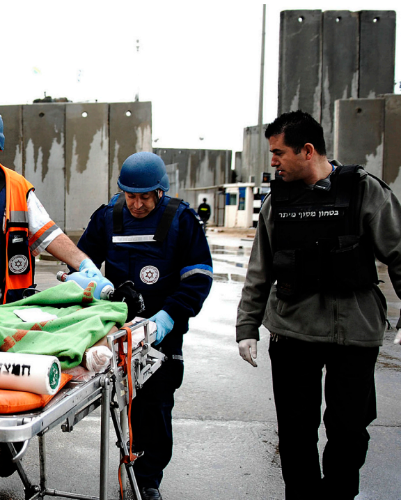
Israel to receive medical treatment at Israeli hospitals. In ill were transferred from the Shifa Hospital in the Gaza

launching this war and hold it responsible for the consequences.