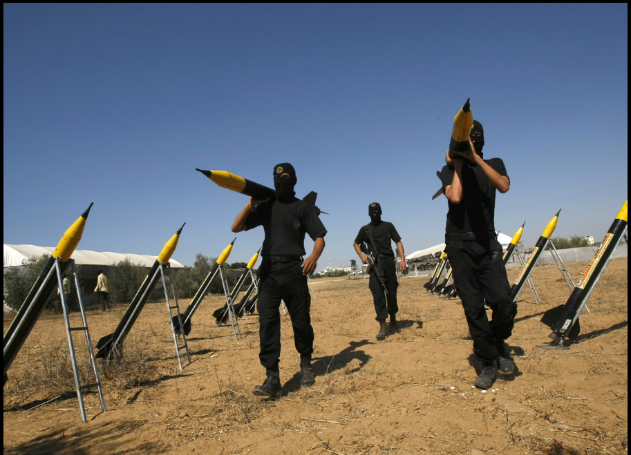
Terrorists in Gaza launching rockets into Israel.

Between January 2001 and December 2008, terrorists in Gaza fired 8,165 rockets and mortars at civilian communities in southern Israel. Hamas has used human shields by embedding its infrastructure in school, hospitals, and apartment buildings.