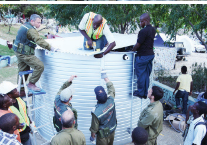
The IDF Search and Rescue Brigade installed a water cistern together with Haitian workers.