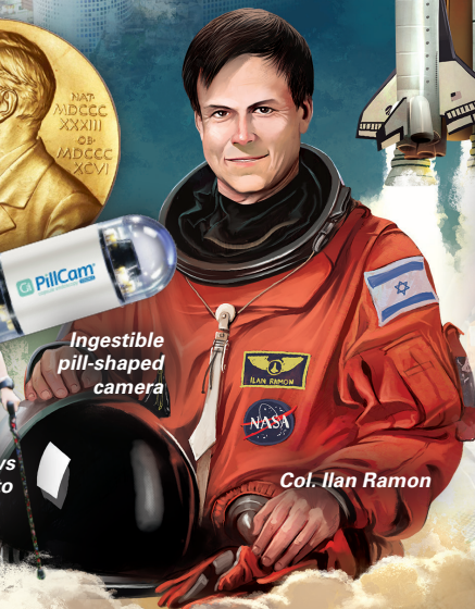
Col. Ilan Ramon