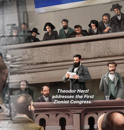
Theodor Herzl addresses the First Zionist Congress.