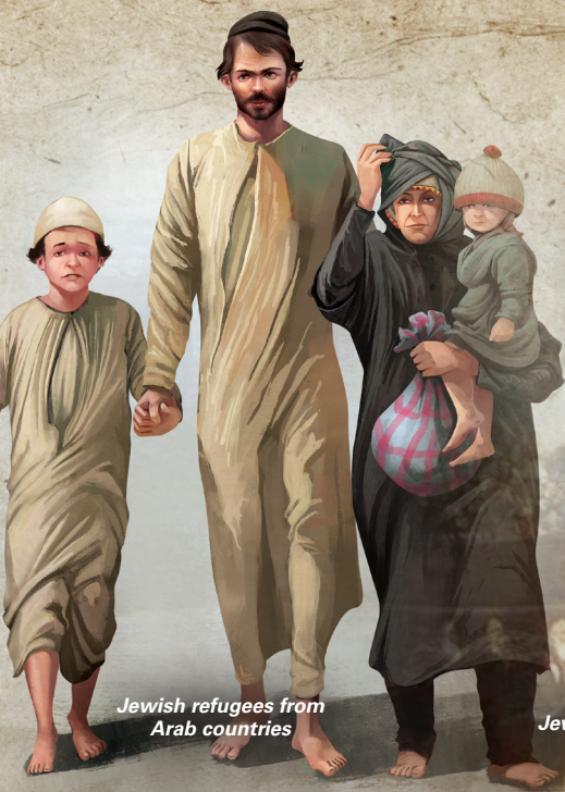
Jewish refugees from Arab countries

ALTHOUGH THEY FLOURISHED AT TIMES, FOR 1,900 YEARS, THEY LIVED AS AN OPPRESSED MINORITY, SUFFERING PERSECUTION, EXPULSIONS, AND ULTIMATELY GENOCIDE.