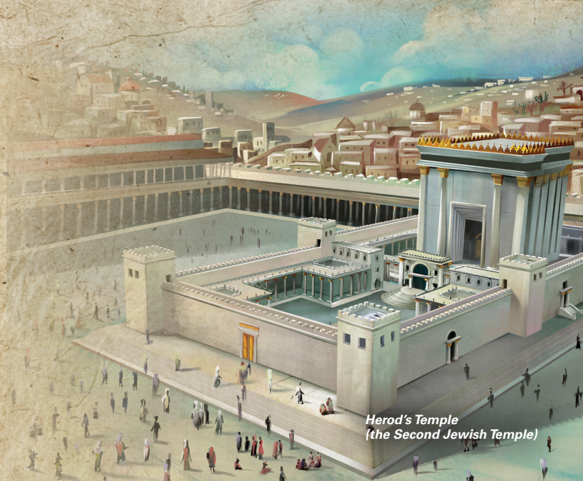
Herod's Temple (the Second Jewish Temple)

OVER 3,000 YEARS AGO AN INDIGENOUS PEOPLE DEVELOPED A THRIVING CIVILISATION AND CULTURE IN THEIR HOMELAND.