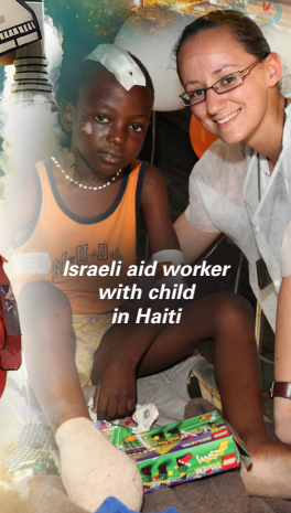
Israeli aid worker with child in Haiti