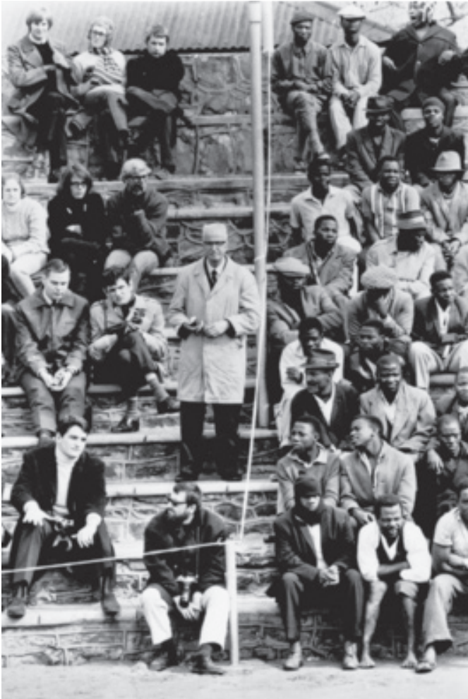
Segregated stands of sports arena. 1969

People were legally segregated by race in every aspect of daily life.