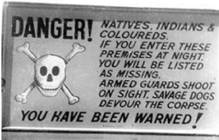
Signs demonstrate racial boundaries in apartheid South Africa.

By apartheid law, South Africans of color were segregated in every aspect of daily life—train stations, beaches, restrooms, schools, and restaurants—except for churches.