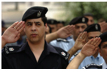
The Palestinian police force

Palestinians formed their own government, the Palestinian Authority, after the Oslo Accords were signed. The PA runs Palestinian civic society, from schools to police forces, law courts, and a legislative council.