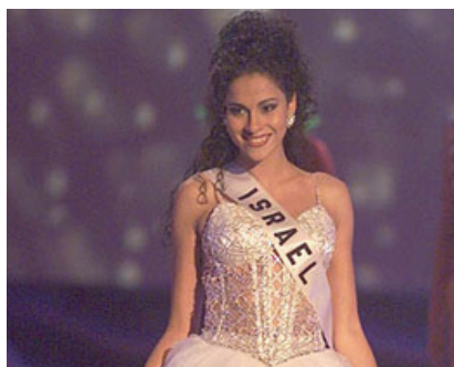
Rana Raslan, an Arab Israeli, was crowned Miss Israel in 1999.