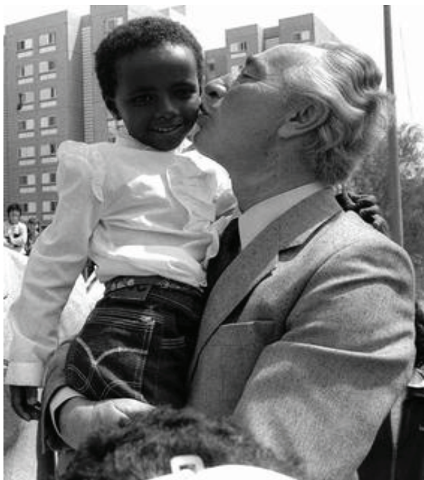
Shimon Peres welcoming new Ethiopian immigrants.

Israel rescued tens of thousands of Ethiopian Jews and welcomed them into Israel. Israel also rescued the boat people from Vietnam and has been saving the lives of thousands of Sudanese refugees, including Darfuris, who escaped from Sudan through Egypt.