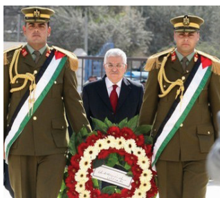
Palestinian honor guard escorts Mahmoud Abbas, president of the Palestinian Authority.

Palestinians in the West Bank and Gaza have never been Israeli citizens and do not wish to be. They have their own national movement for self-determination and are a separate national group, just as Mexicans, Americans, and Canadians are separate national groups.