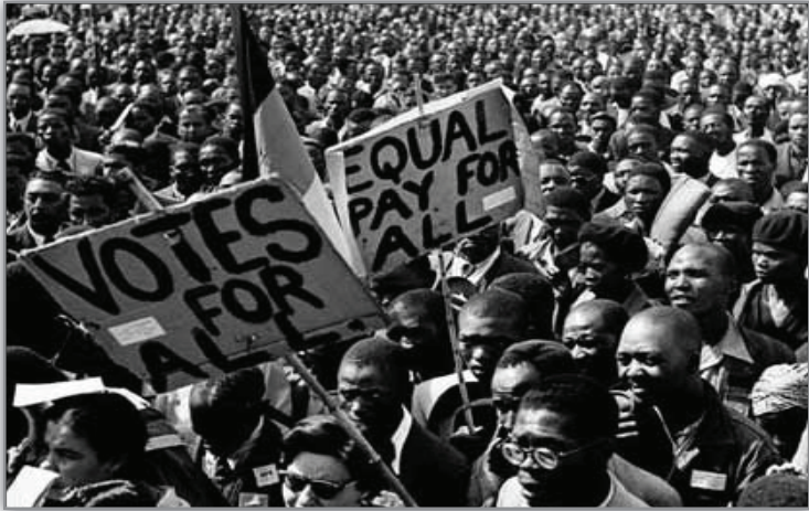
Black South Africans demonstrate for political rights.

South Africa's 80-percent non-white majority fought brutal oppression to regain citizenship and voting rights.