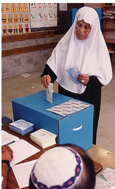
Arab women vote in Israeli elections.