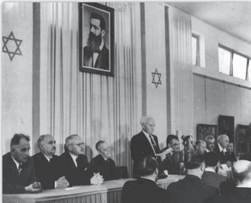
David Ben-Gurion reads the Declaration of Establishment of State of Israel, May 1948.

Israel declares statehood and a legal system based on equal political and civil rights for all.