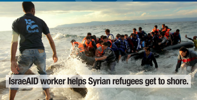
IsraeAID worker helps Syrian refugees get to shore.

Israel is a world leader in innovation and humanitarian aid. Israelis are helping people all over the world overcome hunger, disease, water scarcity, war, terrorism, natural disasters, environmental degradation, cyber threats, and much more.