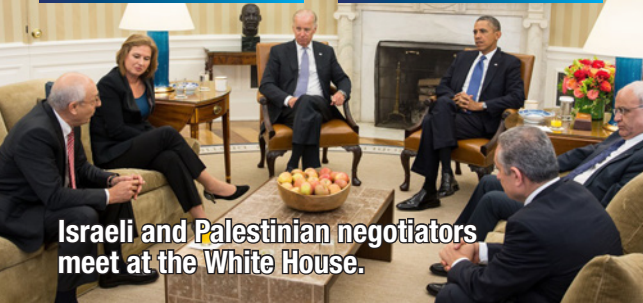
Israeli and Palestinian negotiators meet at the White House.

Israel made peace with Egypt in 1979 and Jordan in 1994. Israelis have agreed to or offered at least four major proposals to end the conflict with the Palestinians and help create a Palestinian state. Palestinian leaders have said no each time, to the detriment of both peoples.