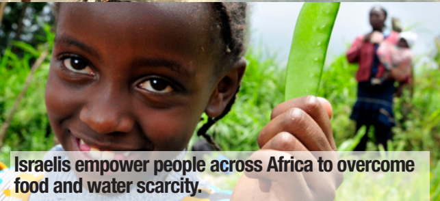
Israelis empower people across Africa to overcome food and water scarcity.