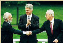
Israel-Jordan Peace Treaty