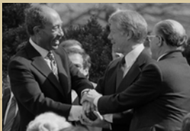
Israel-Egypt Peace Treaty