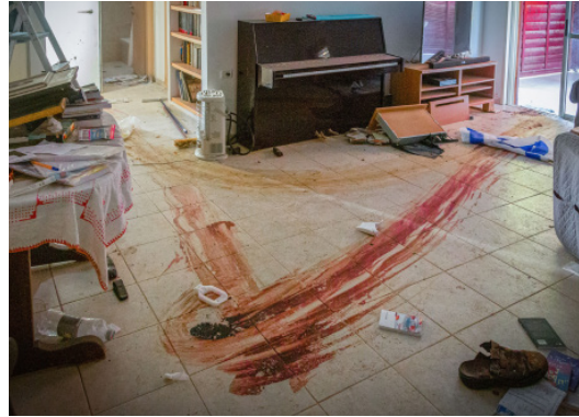
October 7, 2023: Bloodstained floor of a home in Kibbutz Be'eri, where Hamas tortured and murdered civilians

One of Israel's goals is to prevent Iran from building and then transferring nuclear weapons to genocidal terrorists.