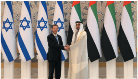
Isaac Herzog Presidential Visit to the United Arab Emirates, January 2022