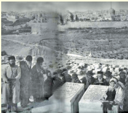
Jews on Jerusalem's Mount of Olives, 1893

–Yusef Diya al-Khalidi, Mayor of Jerusalem, 1899